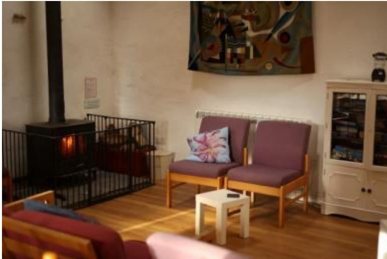
Bunkbarn sitting room