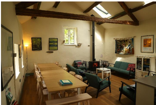
Bunkbarn sitting room and dining table