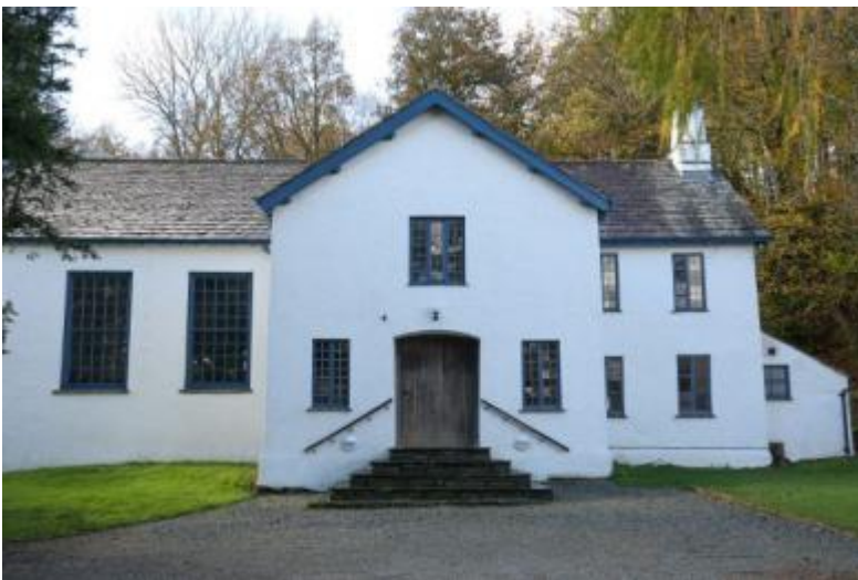
Quaker Meeting House front