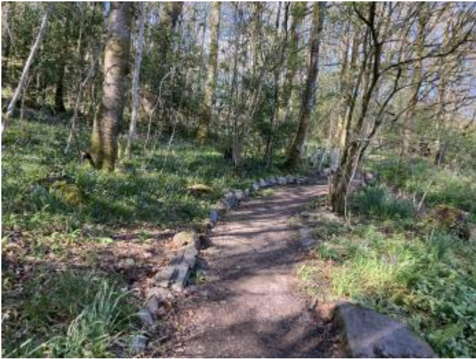
Path into woods