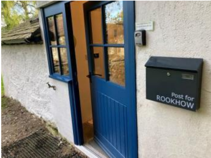
Quaker Meeting House side door