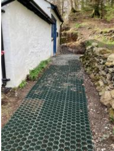
Accessible pathway: side entrance of Meeting House