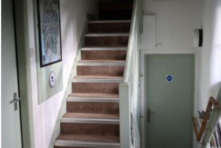
Stairs to upstairs bedrooms