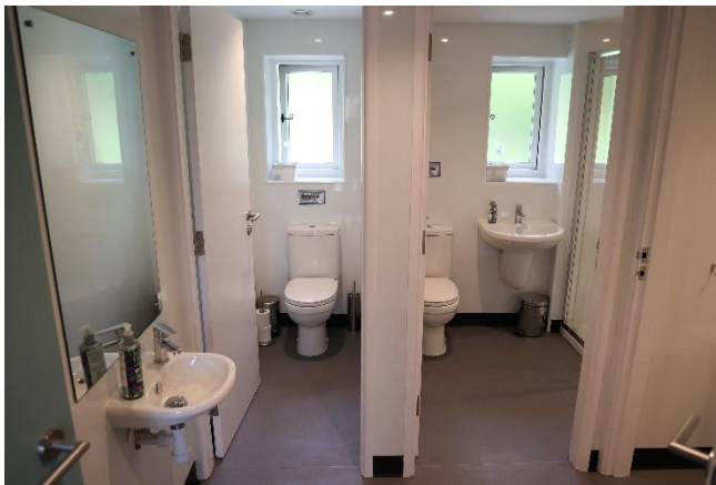
Bunkbarn toilets and showers