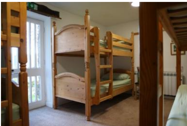
Downstairs 8 bedded room (4 bunks)