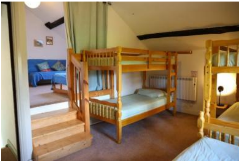
Upstairs bedrooms (2bed- singles; 6 bed- 2 bunks and 2 singles)